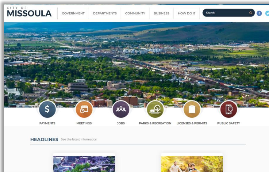
Missoula MT https://www.ci.missoula.mt.us/