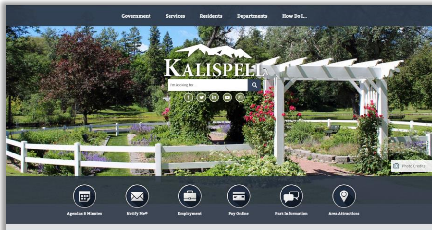
Kalispell MT http://www.kalispell.com/