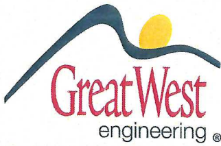
EXHIBIT "A" SPECIFIC TASK ORDERS